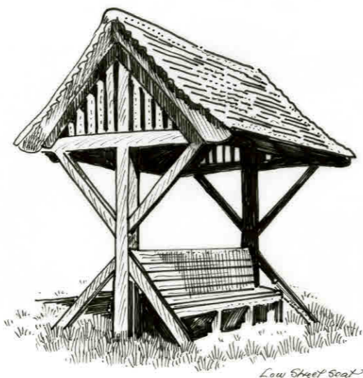
Low Street Seat

The pair of thatched cottages which you will see in Low Street on the left hand side were once used as a