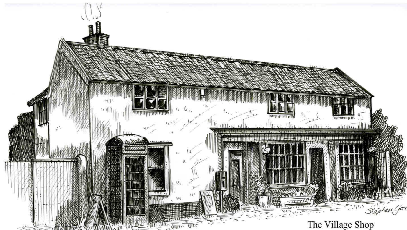
The Village Shop

doctor's surgery and a police station. Court House Cottage, overlooking the Green, is one of three 15 th century timber-framed dwellings with an overhanging upper storey and was used as a manorial court meeting room and public house.